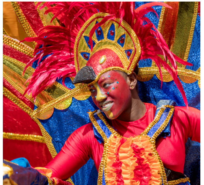
ALL PHOTOS: Youngsters enjoy parading in their costumes during Carnival