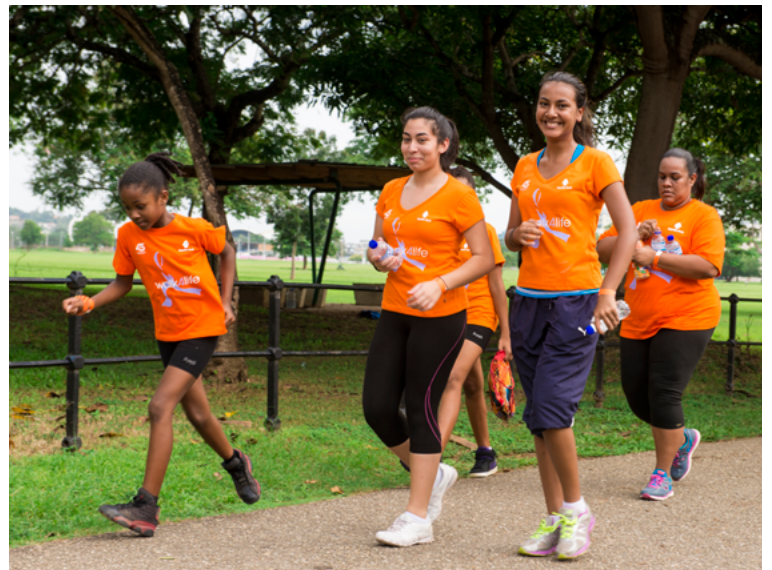
THIS PAGE: Participants show their support for the fight against cancer