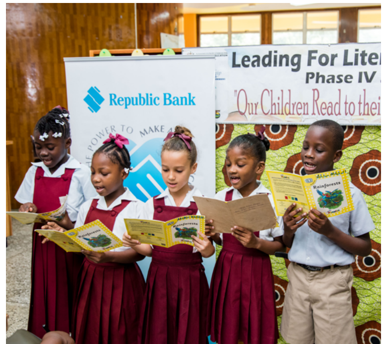
TOP: Infant Two students at Caratal Sacred Heart RC practice letter sounds RIGHT: Students from Belle Gardens A.C. Primary School, Tobago, participate in the community reading segment of the programme