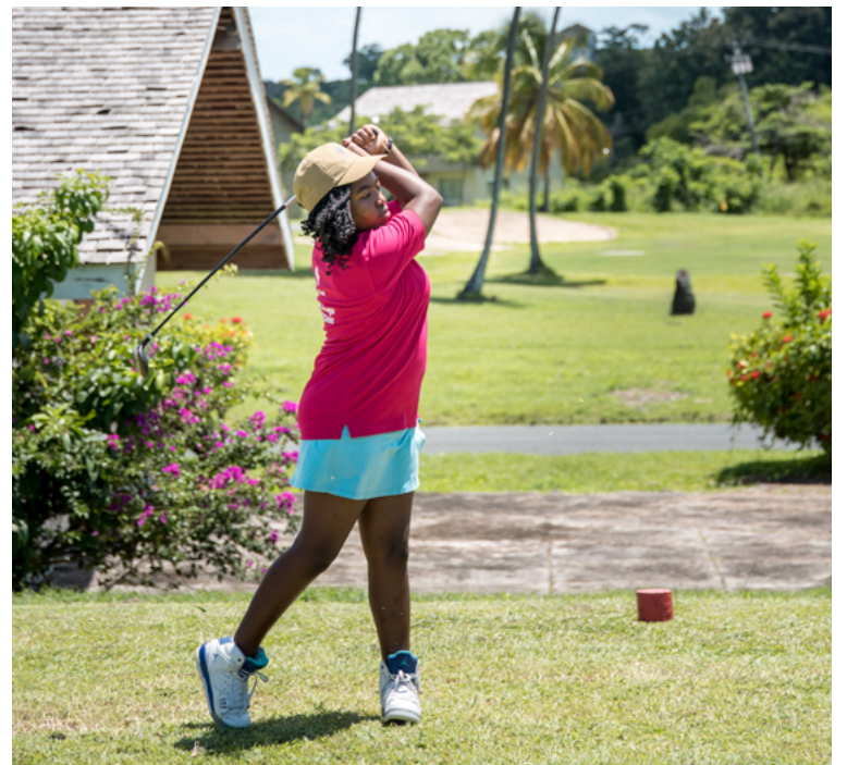
ALL PHOTOS: Young golfers in the making

With vision honed by years of tracking a little white ball against a hazy sky, he can see clearly that the sport's future in Tobago is assured.