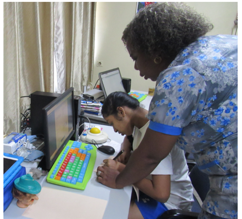
TITLE PAGE: A teacher poses with students at the Mytyl School THIS PAGE: Mytyl School students now have computers in their classrooms and a Student Track system for monitoring progress