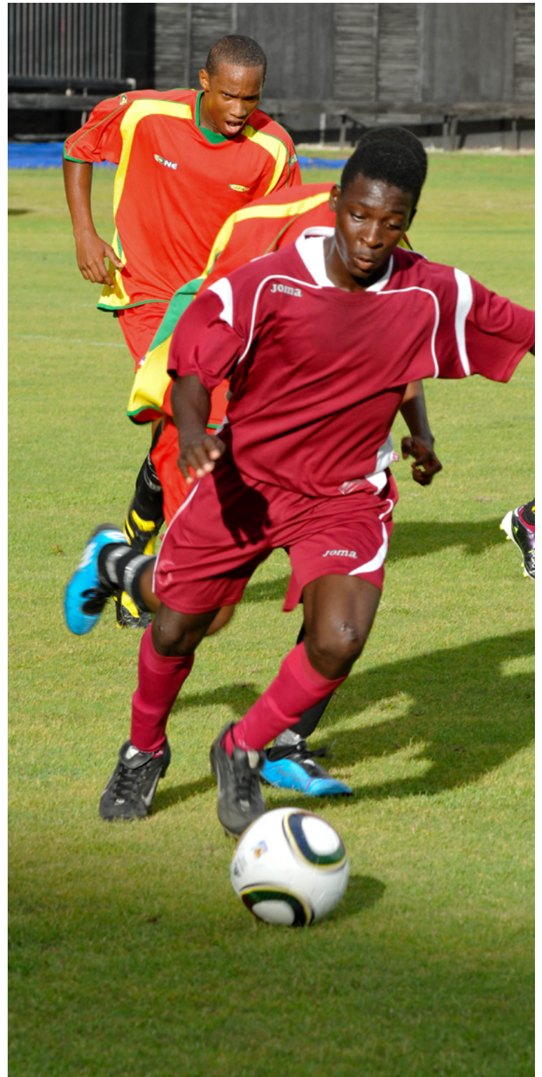
Left: Young footballers celebrate at their prize giving ceremonies Right: Young footballer dribbles the ball during the game