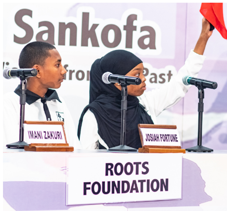
TITLE PAGE: A young participant in the Spoken Word Competition enthralled the audience TOP: Participants from The Roots Foundation pose at the start of the finals.

In the end, the Roots Foundation team definitely proved their sportsmanship, staying behind to cheer on rivals, even after they themselves had tumbled out of contention.