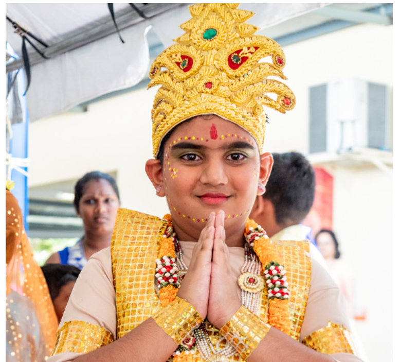
TITLE PAGE: A beautiful portrayal of Lord Shiva TOP: The Palmyra Hindu School choir performs in the Bhajan category BOTTOM: A student portrays Lord Rama

“But we want you to learn and appreciate your religion as well,” he quickly adds.